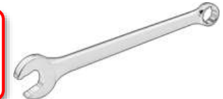
9/16" Box Wrench